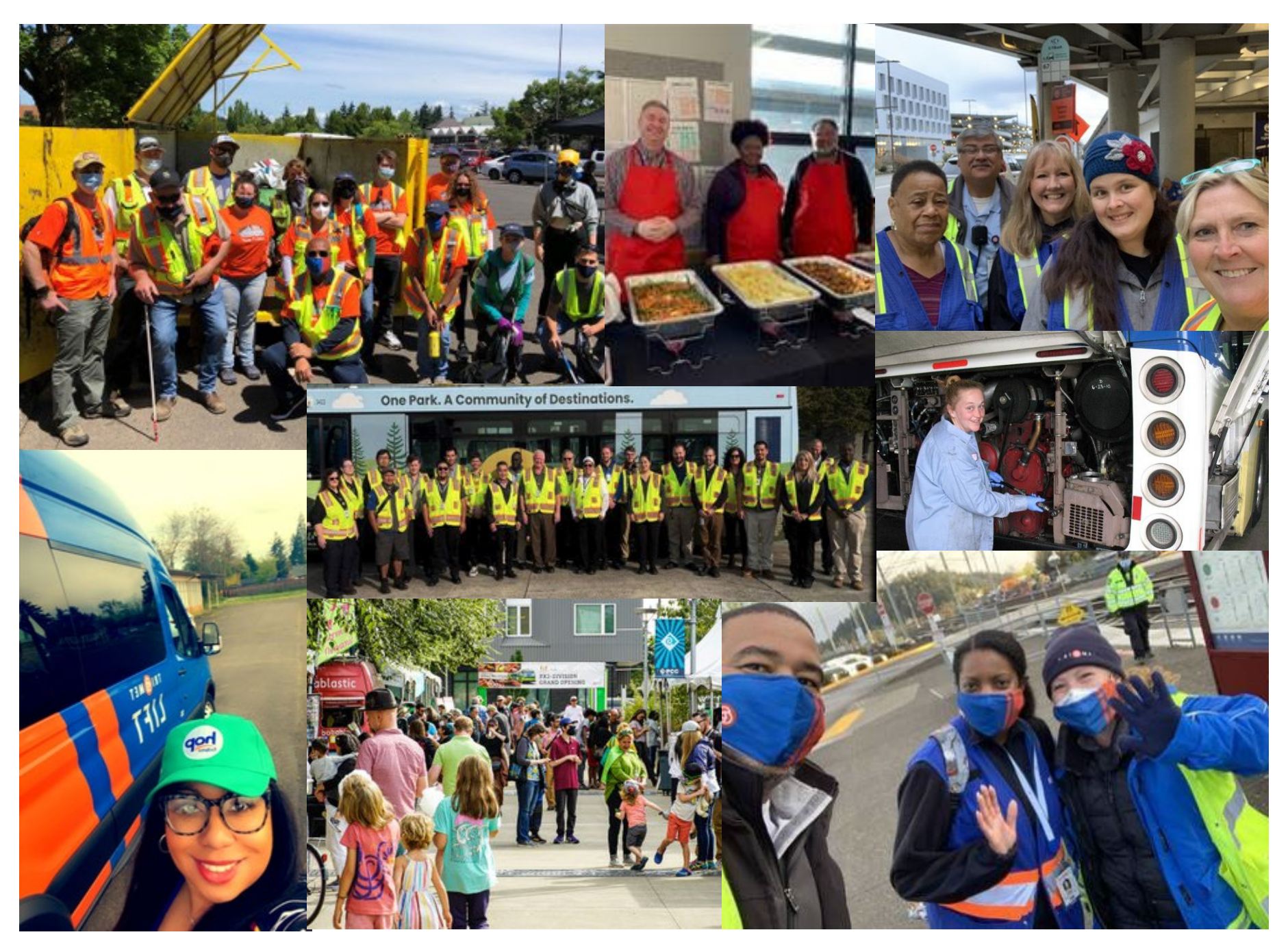
vi TRIMET BUSINESS PLAN FY2024 – FY2028