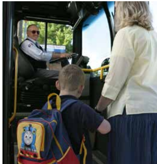
This vision recommends service enhancements that would improve access to education.

Passing Through Flexible Federal Funds for Transit Service There are areas where the businesses and/or homes are so scattered or are located on so much land that there aren't enough people within walking distance of bus stops to cost-effectively provide fixed route bus service. In some instances there aren't