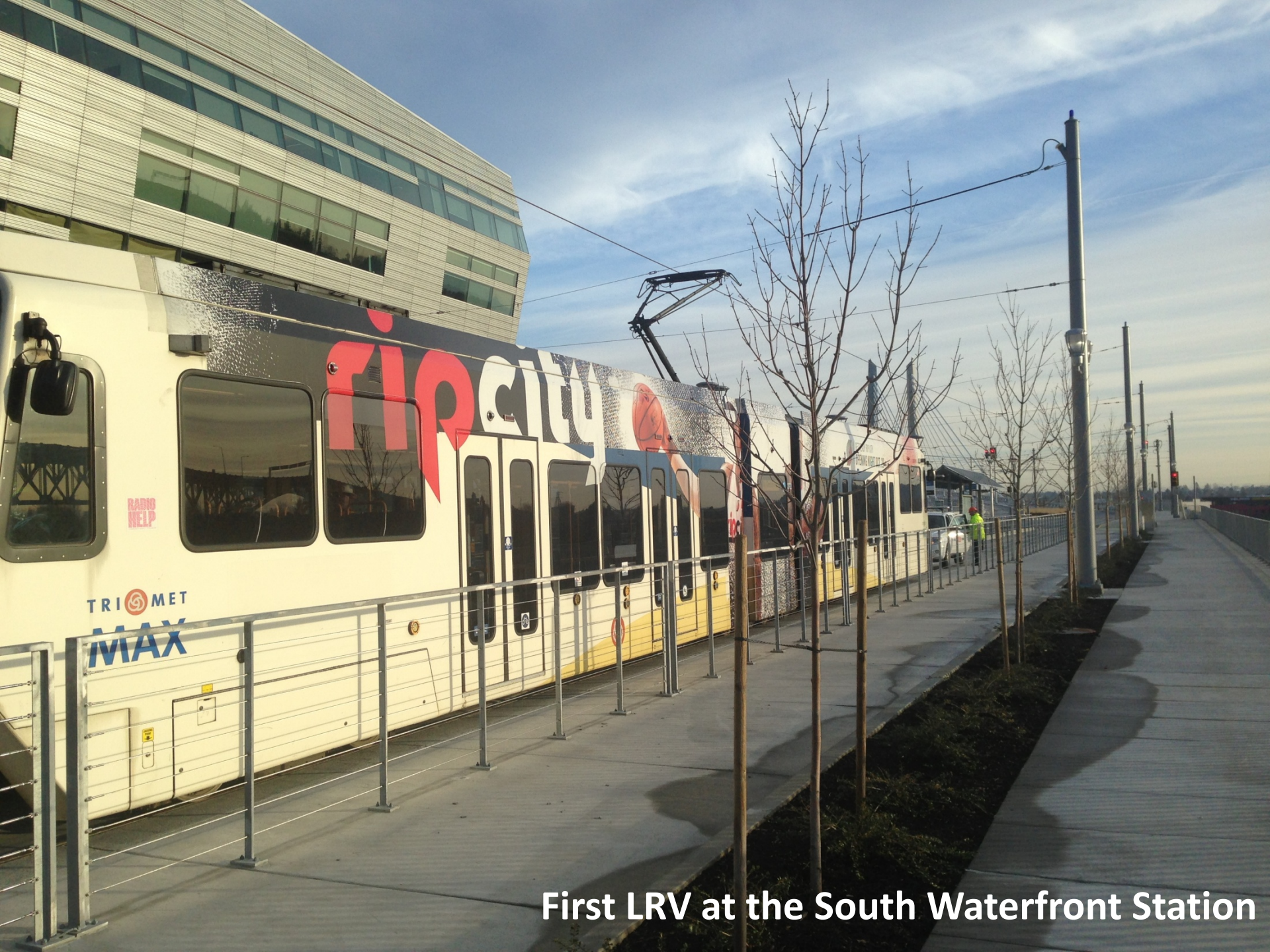
First LRV at the South Waterfront Station