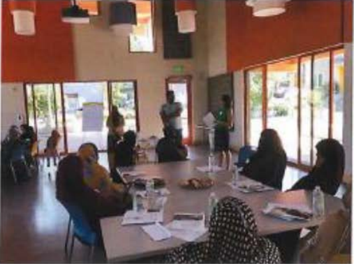
Somali-speaking design workshop at Stephens Creek